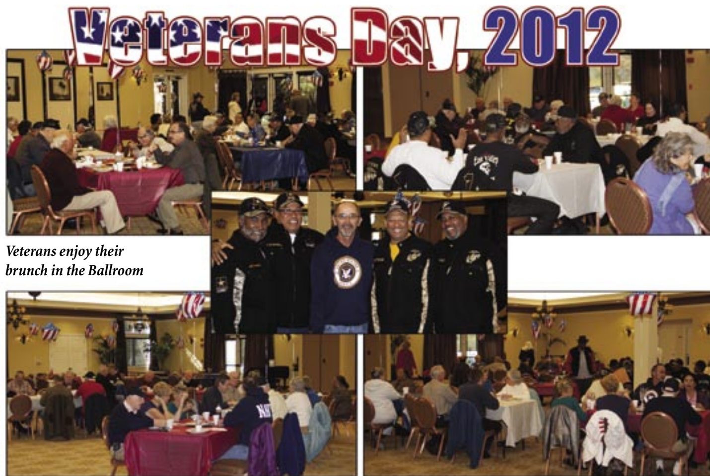
Veterans enjoy their brunch in the Ballroom