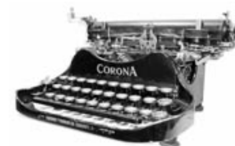
NEIGHBORLY NOTES | 6