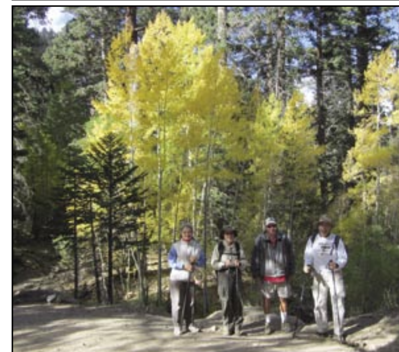
Hiking Club members enjoy fall in the San Gorgonio Mountains