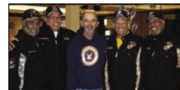
VETERANS DAY IN FOUR SEASONS | 20