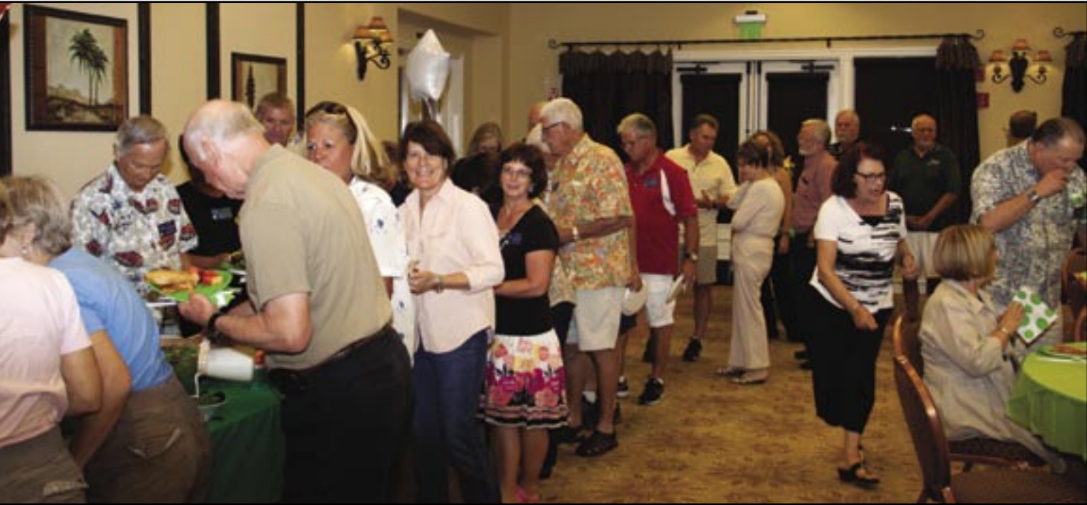
Four Seasons Beaumont Racquet Club members enjoy the annual general meeting & buffet dinner