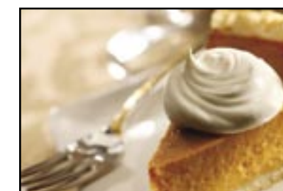
MRS. SMITTY'S HOLIDAY PIES | 22