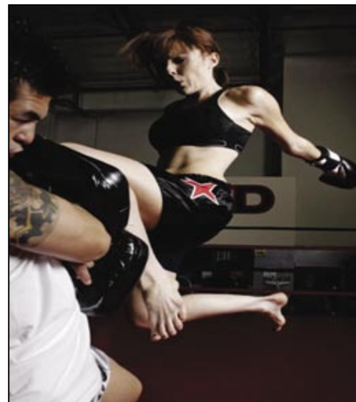
WOMEN'S SELF DEFENSE CLASS | 12