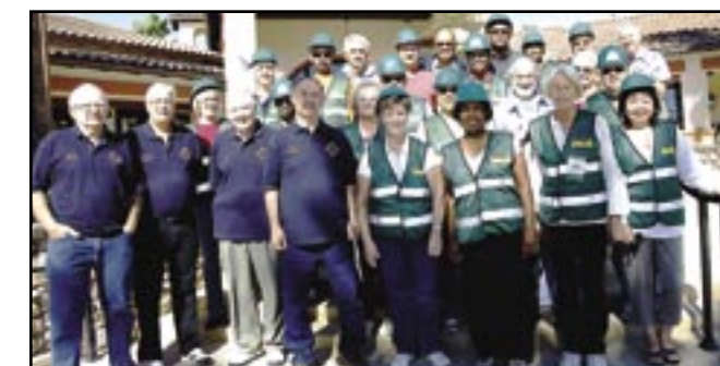
EMERGENCY PREPAREDNESS EXPO | 10