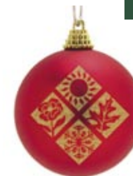
HOLIDAY HOME TOUR | 11