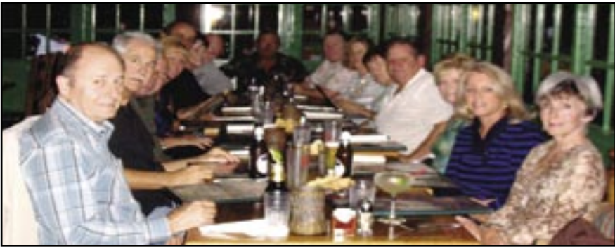
Members enjoying dinner in Palm Springs