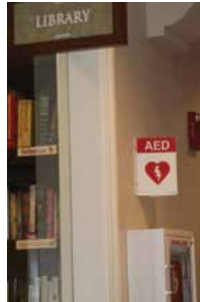
2. Outside of the library