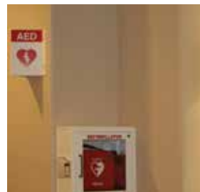
3. Across from the RCN Computer Room