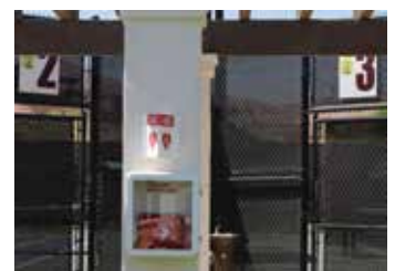
9. By the tennis courts