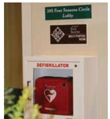
8. Next to the front desk at The Courts