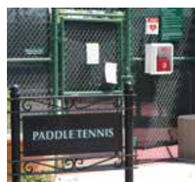
5. At the Paddle Tennis courts