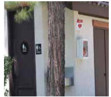
6. By the outside restrooms, past the shuffleboard courts