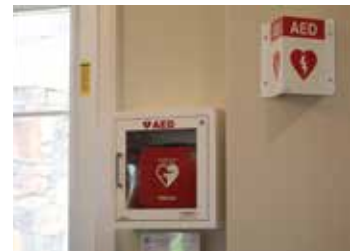
7. Inside the Summit front door to the left as you enter