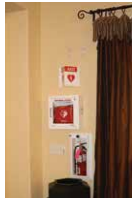
1. Inside entrance to Ballroom